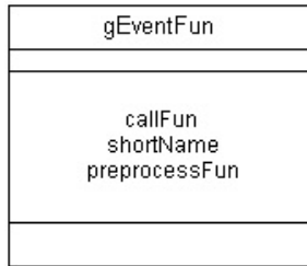
Figure 6: The gEventFun Class.

the preprocessFun slot is a list of all preprocessing functions that must be called before the callback function.