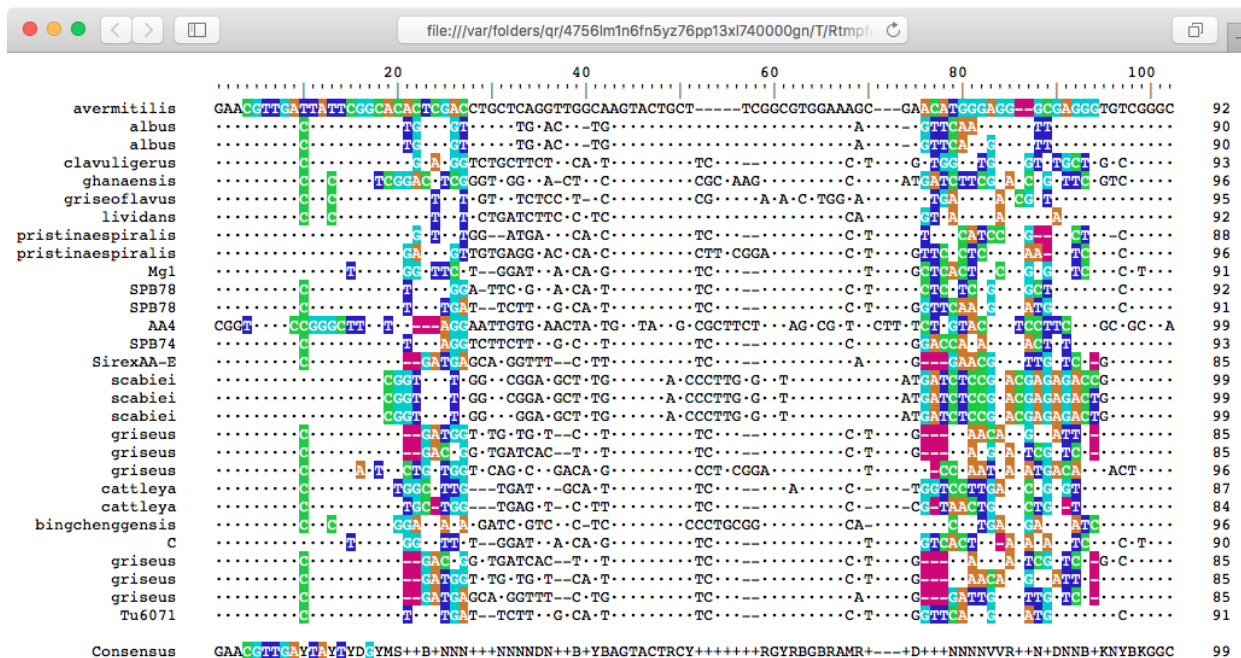
Figure 2: Amplicon with the target site for each primer colored

> # move the target group to the top > w <- which(names(amplicon)=="avermitilis") > amplicon <- c(amplicon[w], amplicon[-w])