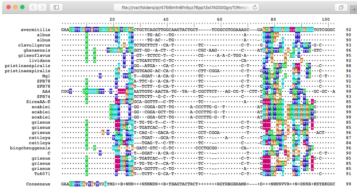
Figure 2: Amplicon with the target site for each primer colored

> # move the target group to the top > w <- which(names(amplicon)=="avermitilis") > amplicon <- c(amplicon[w], amplicon[-w])